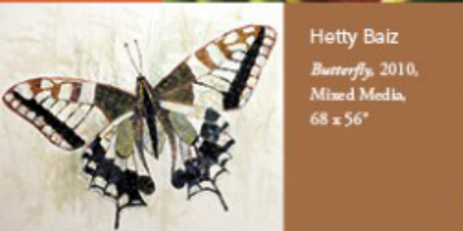
Hetty Baiz Butterfly , 2010, Mixed Media, 68 x 56"