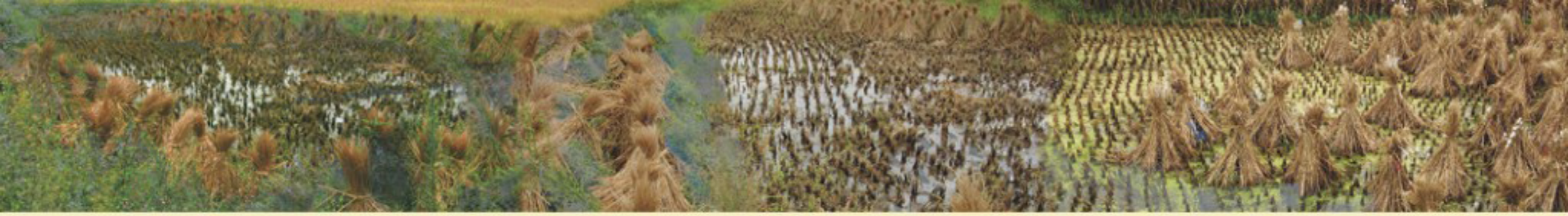
Ernestine Ruben Chinese Fields , Unique, 2008, Photograph from DanceScapes Series.