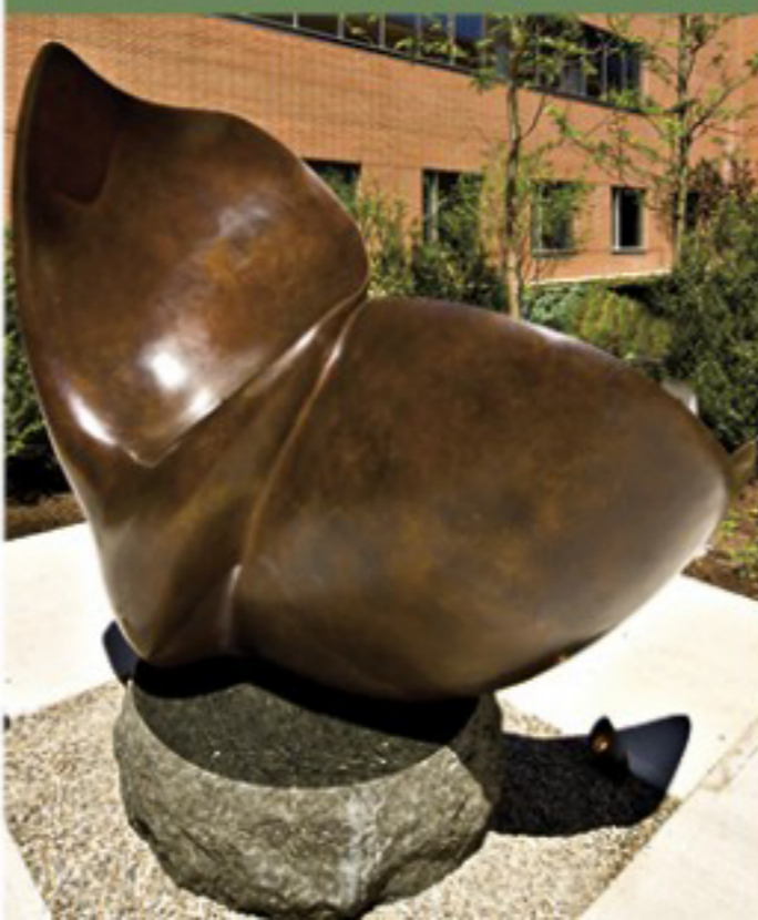
Gordon Gund Flakes , Bronze, 2004, 77 w x 30 d x 72"

"We are driven to do everything possible to help people heal. There is compelling evidence demonstrating that art can contribute meaningfully to achieve that goal."