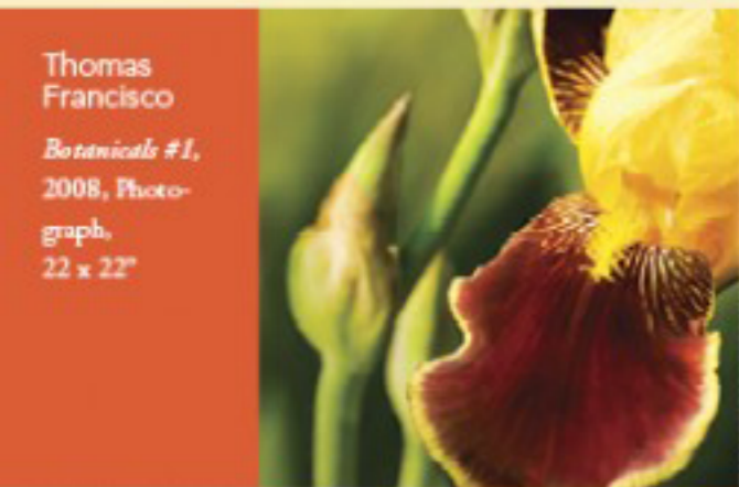
Thomas Francisco Botanicals #1 , 2008, Photo- graph, 22 x 22"

"Art and Healing come together when the art has certain transformative powers found in the life of the art and the aliveness of the art. Healing art needs to transport you to a new state. When you view my art in the new hospital, I wish to carry you to my land where my images can convey you to health."